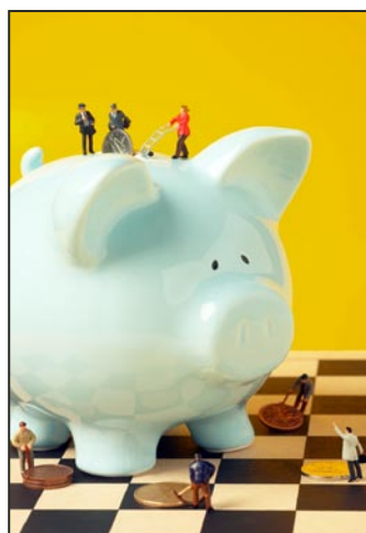
The Cash Management module helps you manage your money.

It's easy to forget to enter bank fees and then be unable to reconcile at month end. With the Cash Management module, you can use the Enter Bank Transactions option to add information about bank deposits, charges, credits, withdrawals, and transfers that weren't entered in Accounts Receivable.